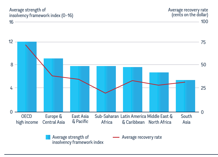
FIGURE 12.1 OECD high-income economies have well-developed insolvency frameworks and the highest recovery rates